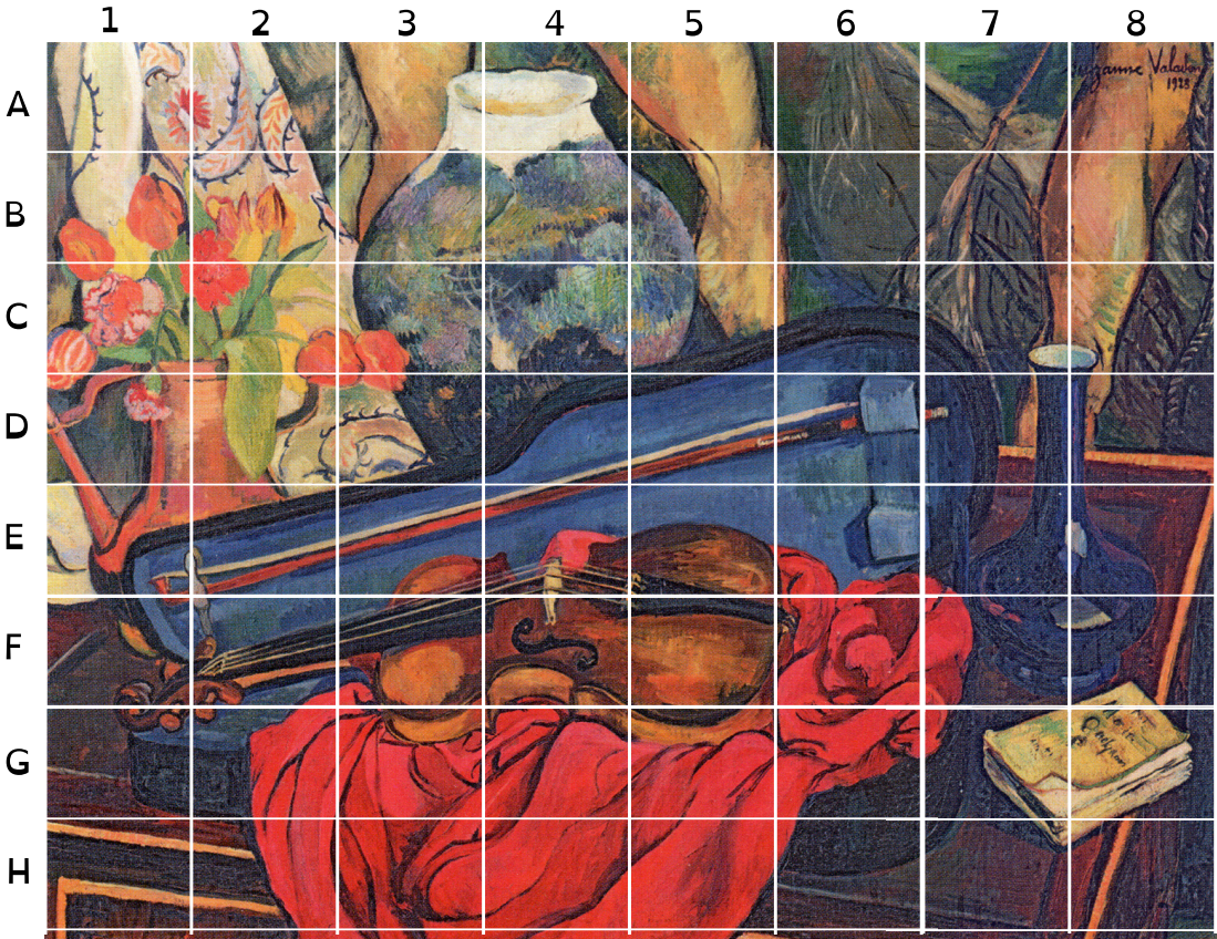
Suzanne Valadon, The Violin Case, 1923

Draw an X to mark where you have hidden your Easter egg. Don't let your opponent see. Take turns to ask questions to identify where the egg is hidden.