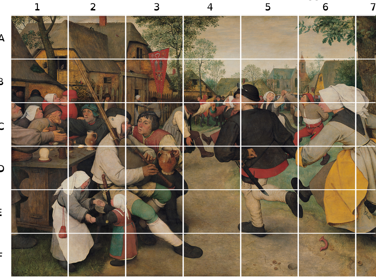
Peter Brueghel the Elder, The Peasant Dance, 1568

Draw an X to mark where you have hidden your Easter egg. Don't let your opponent see. Take turns to ask questions to identify where the egg is hidden.